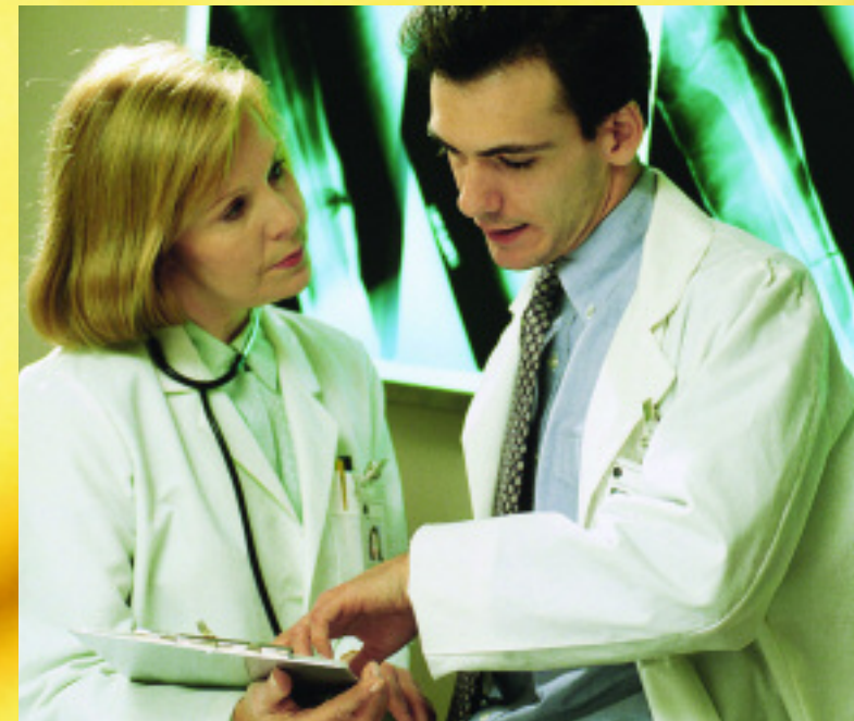
Physician Hospital Organization